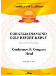
TOPHOTELS – Turkey's Leading Conference

2024-2025 WINTER SEASON CONCEPT (15 OCTOBER – 05 MAY)