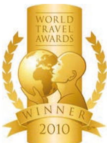
WTA – Europe's Leading Luxury Resort