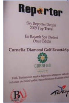
REPORTER MAG. – BEST SPA HOTEL