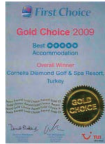
FIRST CHOICE GOLD CHOICE