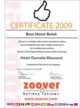
ZOOVER – BEST HOTEL BELEK