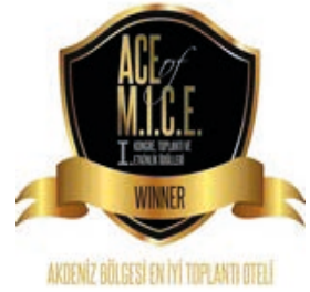
ACE of MICE – Best Congress Hotel in Antalya