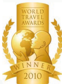
WTA – Europe's Leading Spa Resort