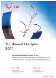
TUI – UMWELT CHAMPION