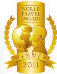
WTA – Europe's Leading Resort Villa