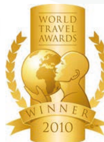
WTA – World's Leading All Inclusive Golf Resort