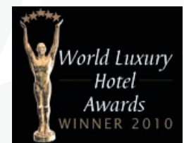
WORLD LUXURY – BEST LUXURY GOLF RESORT