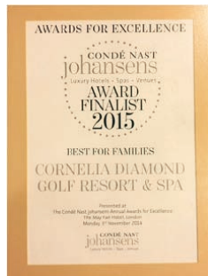
CONDE NAST JOHANSENS