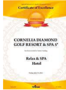
TOPHOTELS – Turkey's Leading Relax & SPA