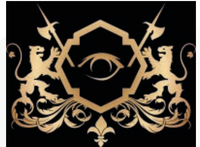
EYE AWARD – EUROPE'S BEST SPORT HOTEL