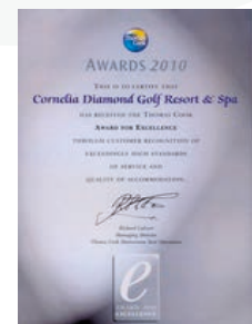
MARK for EXCELLENCE