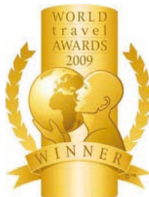
WTA – Turkey's Leading Spa Resort