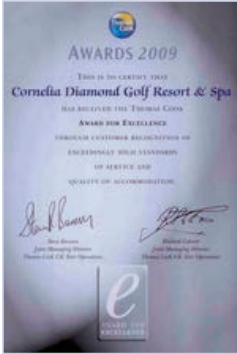
AWARD for EXCELLENCE

2024-2025 WINTER SEASON CONCEPT (15 OCTOBER – 05 MAY)