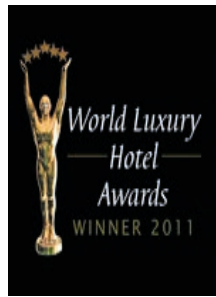
WORLD LUXURY – BEST LUXURY SPA RESORT