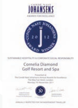
CONDE NAST JOHANSENS – WINNER (Sustainable Hospitality and Corporate Social Responsibility 2012)