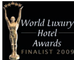
WORLD LUXURY – LUXURY GOLF RESORT