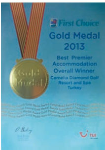
FIRST CHOICE – GOLD CHOICE