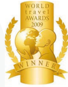
WTA – Europe's Leading Spa Resort