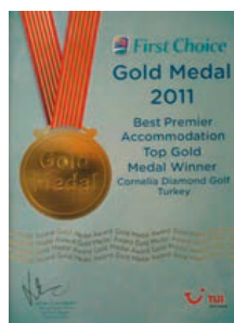
FIRST CHOICE – GOLD MEDAL