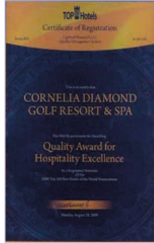
TOPHOTELS – AWARD for EXCELLENCE