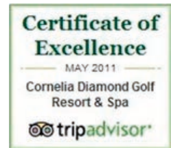
TRIP ADVISOR – CERTIFICATE OF EXCELLENCE