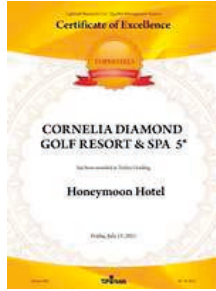
TOPHOTELS – Turkey's Leading Honeymoon