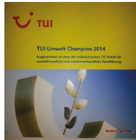
TUI – UMWELT CHAMPION