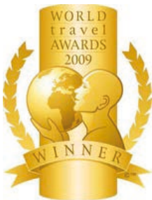
WTA – Europe's Leading Golf Resort