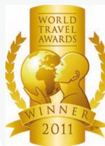
WTA – World's Leading Fully Integrated Resort