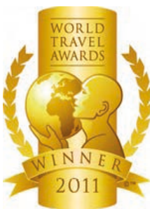
WTA – Europe's Leading Luxury Resort